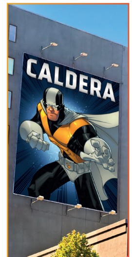
For Grand and Super-Wide Signage