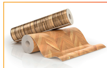
For Industrial Printing